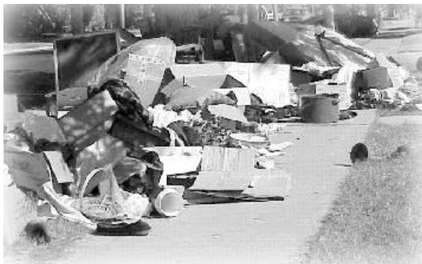
City develops system to deal more quickly with illegal dumpings like this one.

If someone has dumped garbage illegally in your neighborhood, you now have an expedited city service to turn to. Beginning this month, the city has a faster method for dealing with items illegally dumped within the city's limits.