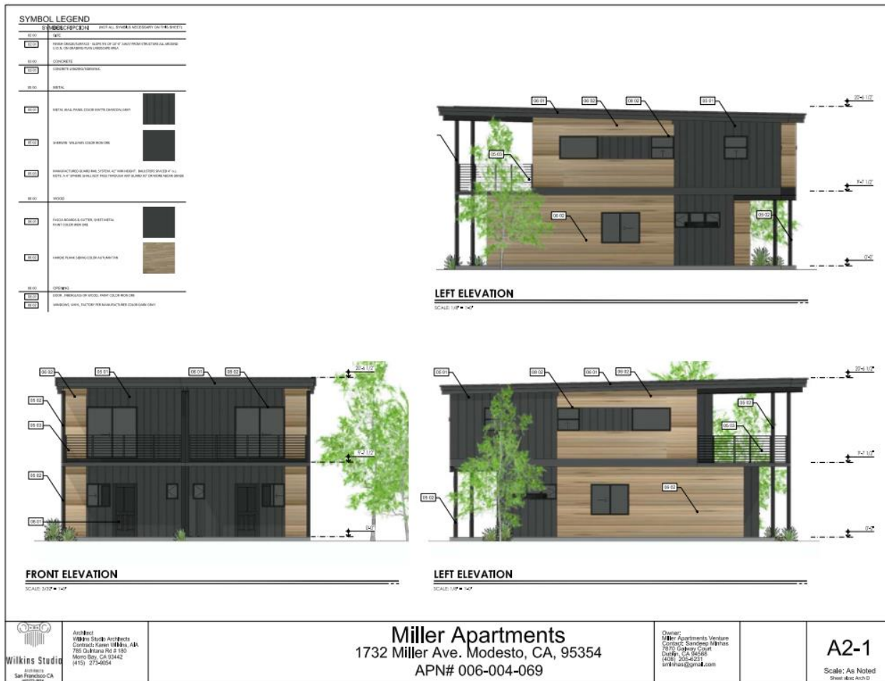
Figure 3: Elevations