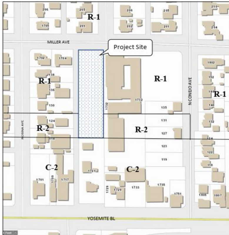
Figure 1: Area Map