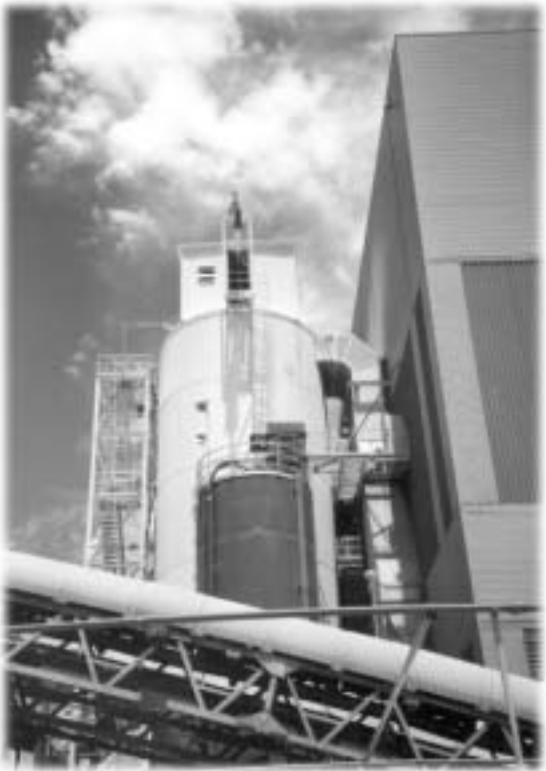
A closer look at some the equipment at the Covanta Waste-to-Energy facility.

Covanta Stanislaus, located about 25 miles outside of Modesto (near Crows Landing), is a truly interesting place. It is a great place to tour. For tour information call the Covanta Waste Recovery Facility at 837-4423.