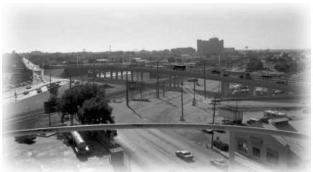
The Kansas-Needham overcrossing will be complete in Fall 2003 and will look similar to this computer-aided rendering of the overcrossing.

Scheduled to open in the fall of 2003, the overcrossing