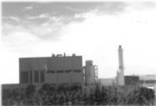
The Covanta Waste Recovery Facility

So the problem was that burning trash and placing it in a landfill both created problems. Questions come